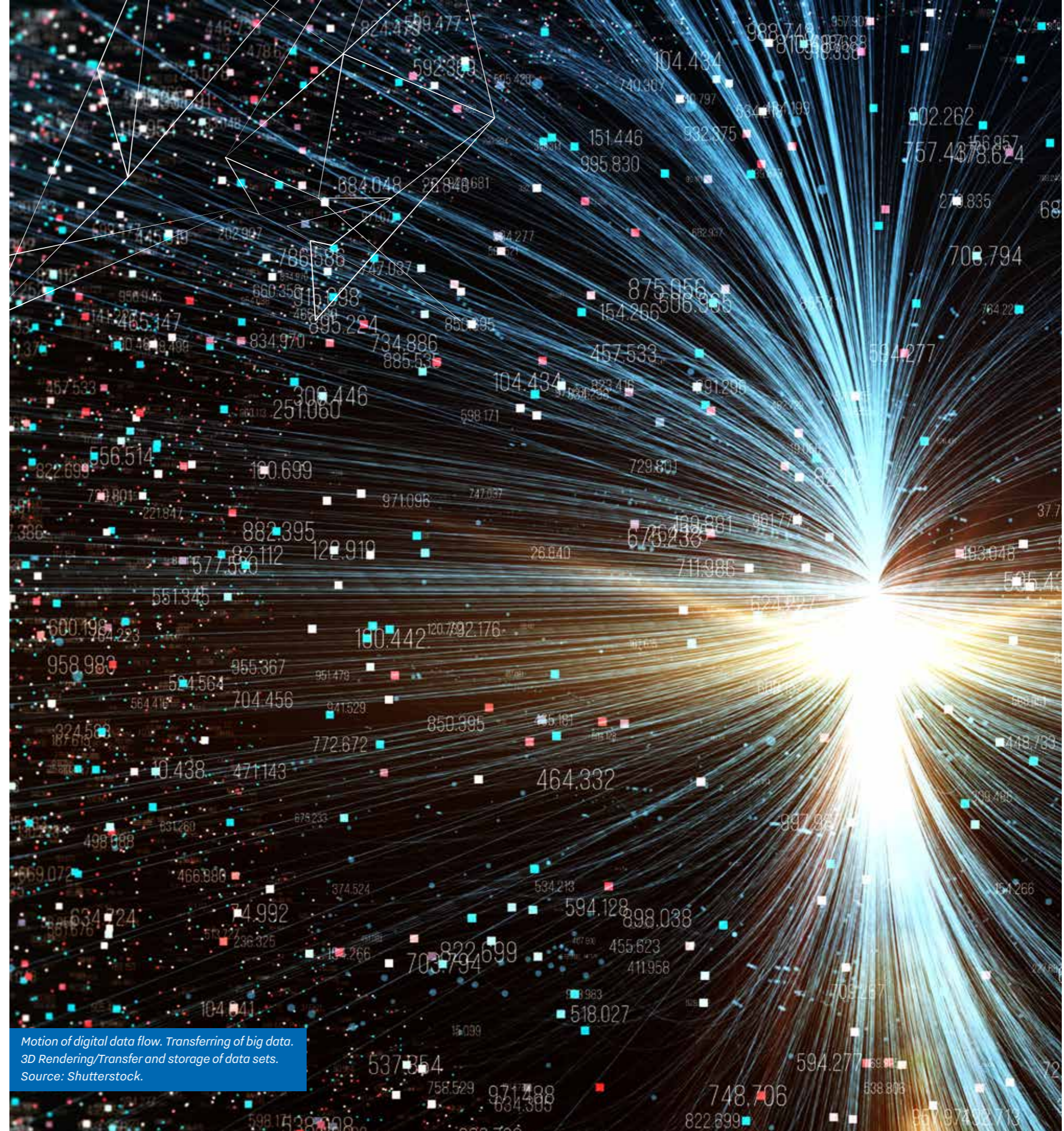
Motion of digital data flow. Transferring of big data. 3D Rendering/Transfer and storage of data sets.

AI has huge potential for healthcare in Canada, especially around deep learning. So to accelerate digital healthcare innovation, CIFAR is now recommending an AI health strategy, AI4H , as “the game changer for Canada”.