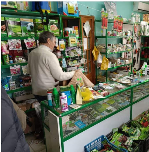
Figure 1. Input supplier with limited knowledge.

See Figures 1 and 2 for an example of different input suppliers.