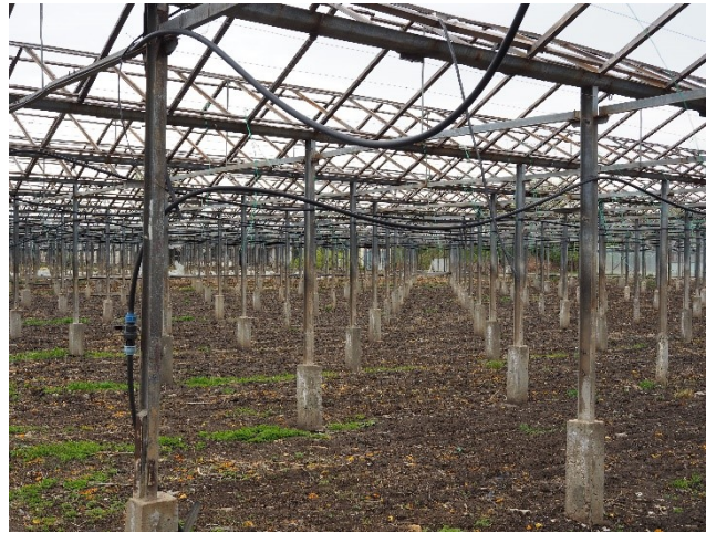
Figure 3. Greenhouse construction from Soviet times, without glass.

replaced it with plastic sheets. The steel construction is not made to support plastic, as with each heavy storm is blows off. Figure 3 shows this greenhouse construction.