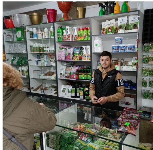
Figure 2. Graduate input supplier with a lot of knowledge.

Growers often do not have the knowledge or experience in recognizing specific pests or diseases, and their cultivation techniques are often basic and easy to improve. Some of the growers, however, have put a lot of time and effort in optimising their greenhouse and are good examples for other growers to visit. In addition to these cultivation methods, some of the growers that we met do not monitor their harvests and have no crop registration. They also have limited experience in marketing their produce. They use standardised fertiliser and pesticide quantities, and furthermore have limited knowledge on