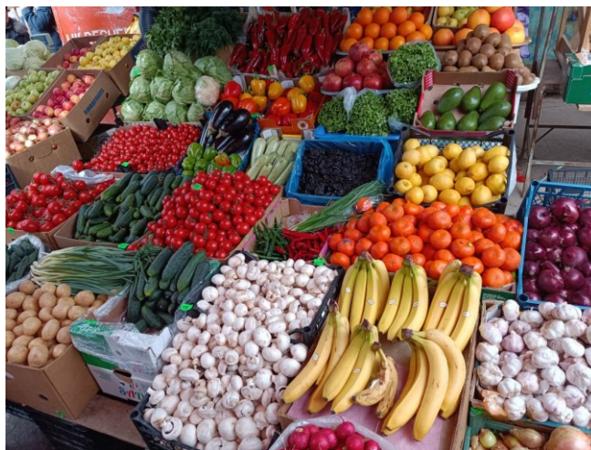
Figure 6. Imported produce at local market in Ceadir-Lunga.

As briefly mentioned before, the growers do not have experience in marketing their produce, and they do not package it, besides in large plastic bags or crates to be transported to the markets. In some cases does the wholesaler or intermediary have a cold storage and repackages, but most of the produce is sold as shown in Figure 6 below.