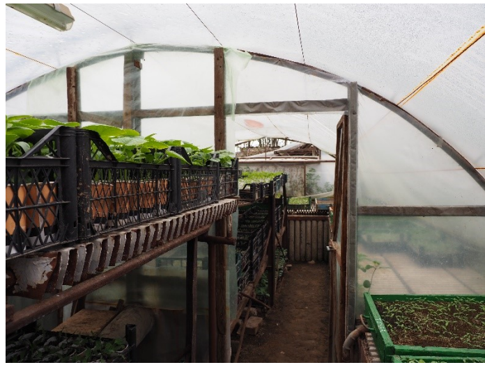
Figure 5. Multiple layer nursery, with no artificial lighting.