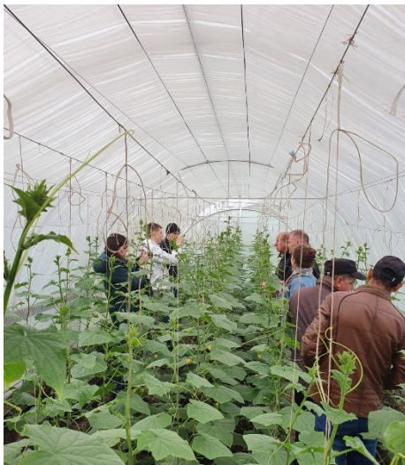
Figure 4. A greenhouse within a greenhouse, with no artificial lighting.

The greenhouse tomatoes and cucumbers are grown in the soil, with drip irrigation, limited ventilation and in some cases heating for either the main greenhouse or their nurseries. In some cases, the growers have constructed a greenhouse within another greenhouse to increase the temperature. However, without proper lighting this means that the plants are weak and thin. Figures 4 and 5 are examples of such constructions.