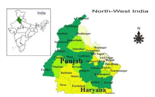
Figure 1: Residue burned on the farm is from the states of Uttar Pradesh, followed by Punjab and Haryana

It is therefore important further to investigate the avoidance of field burning, and instead the paddy straw's removal. Since that will enable faster replanting. It will enable field sanitation, since there can be benefits by recycling nutrients back to soil. And there may be benefits in terms of circularity, as well. Overall the farm output and productivity will increase.