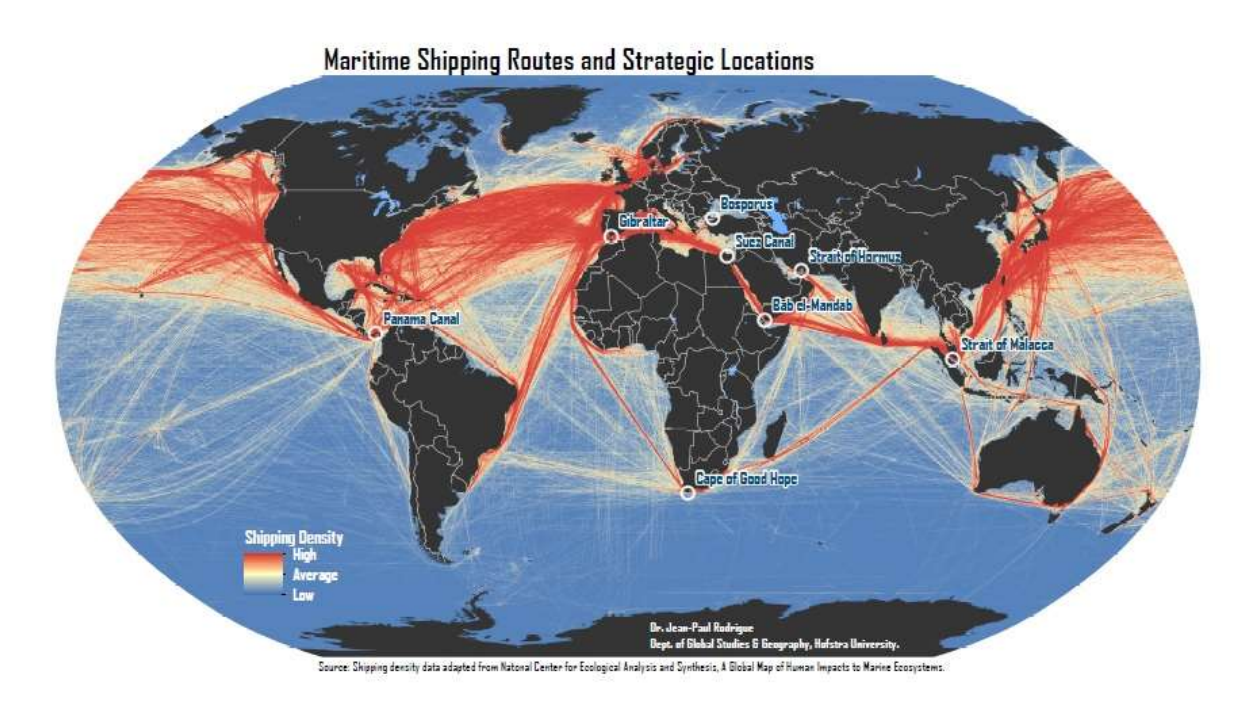
Figure 2. Global shipping routes<sup>27</sup>

Freetown has the largest deep water natural harbour in Africa. With its excellent position tapping in to several existing trade routes, Sierra Leone has the potential to become one of the most important transportation hubs in the continent.