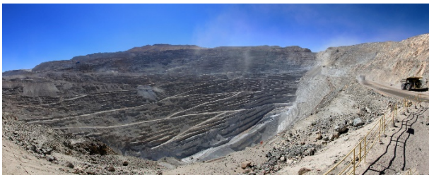
Chuquibambilla, the largest open pit mine in the world

Mining companies, mostly located in the north, face tremendous water shortages. Some of them have their own desalinization plants (15% of water use). The mining industry is already very efficient (more than 70% reuse), but it is always looking for improvement. Desalinization is very expensive because of high energy and transportation costs (from sea level to altitudes of 2000 to 4000 meters). Groundwater pollution and water shortages have led to several conflicts with communities and farmers downstream, which has caused delays in project execution. Therefore, companies need to pay more and more attention to proper management of wastewater and mine tailings as well as stakeholder management. The last couple of years investments in new mining projects have been very limited due to the low copper price. In the coming years however, an increase in investment is foreseen. Projects that are expected to expand are: El Abra (Freeport), Quebrada Blanca (Teck), Spence (BHP), Centinela (Antofagasta Minerals).