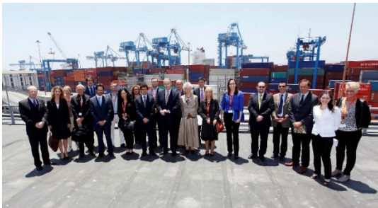
Trade mission with Mayor of Rotterdam 2014, San Antonio port

Annual throughput is 4.145.047 TEUs and a total of 13.739.586 tons, with an annual growth of 3,4%. In 1997 the government started a process of privatization of port terminals, generally executed through mid/long term concessions, all under the regulatory framework of the ten different state-owned port companies (excluding private ports for private use). The largest operators are SAAM and Ultramar.